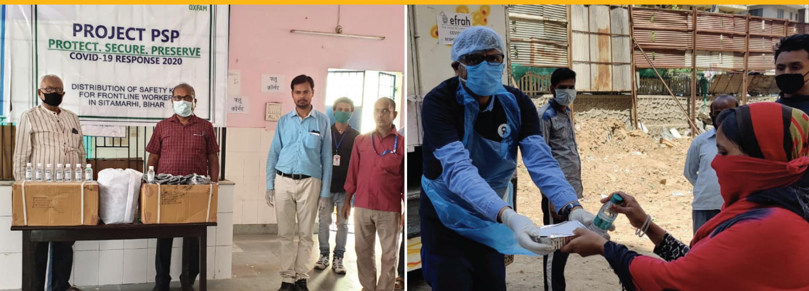
Photo on the left: Distribution of safety kit to Frontline Health Workers in Sitamarhi district of Bihar. Photo on the right: Distribution of dry food ration to migrant labourers in South East Delhi.