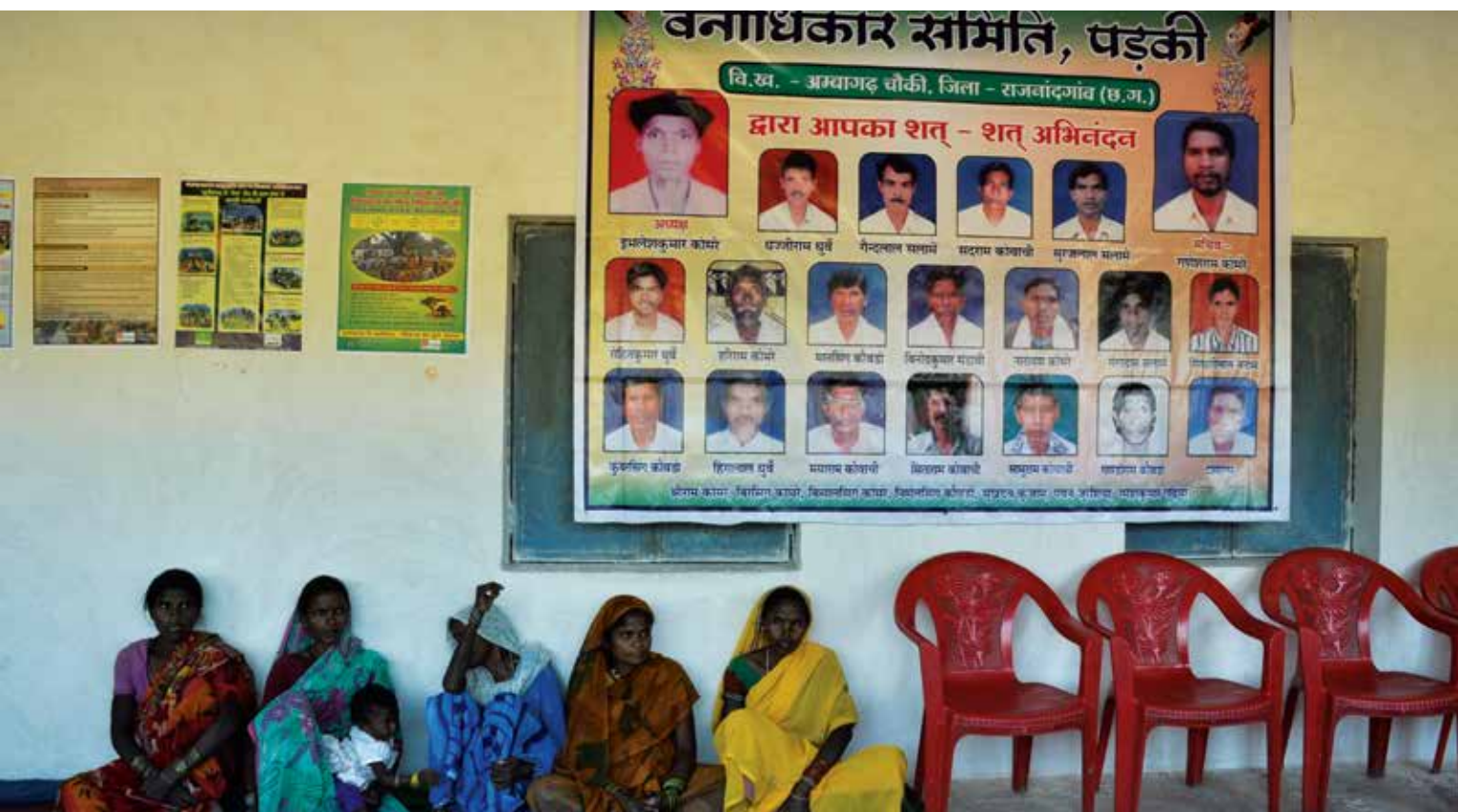
Though women are not yet members of the 4(1)(e) committee, at Padki village, they attend whenever they can. The women also don the role of Thengapalis to guard the forests

At Kongera Gram Panchayat's Junwani village, the resistance came from within the FRC. The Gram Sabha applied for CFR claim over 315.6 ha (780 acres) 16 of its forest, Kongera Dongri. Oxfam