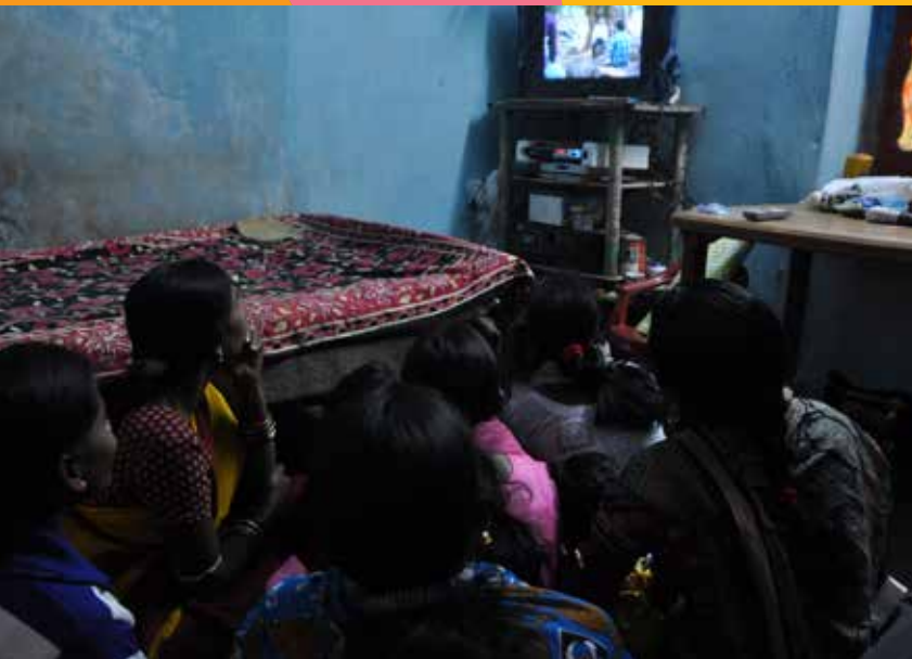
Women at a film screening at Duti Mendi village