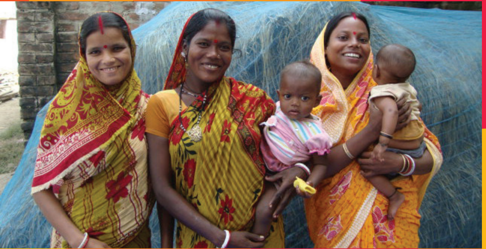
Young mothers in Chakla panchayat, Kishanganj shared that antenatal and postnatal services have significantly improved during the project period.