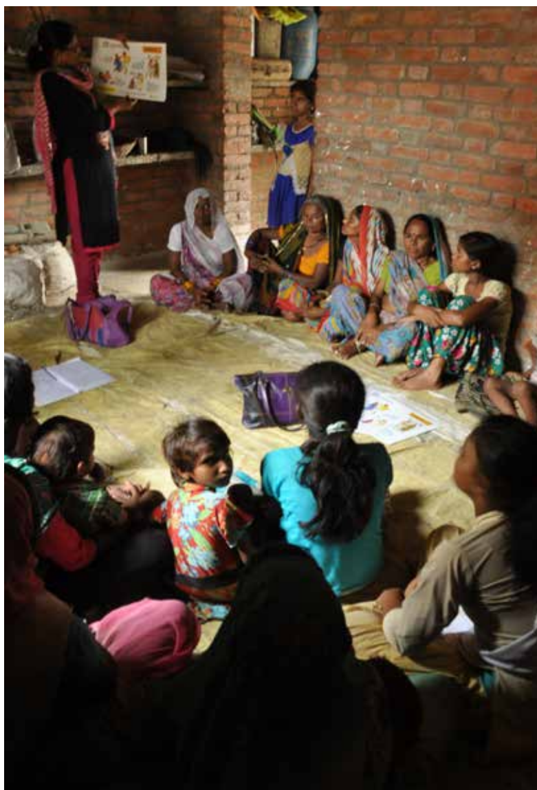
A nigrani samiti meeting in progress at Chakla village in Chitrkoot.

The Samiti members are trained in counselling; over the years they have gained access to police and legal aid cells. After an issue is brought to the notice of the Samiti , a consent letter is filled and signed by the victim or a family member in the presence of the victim. The members then initiate talks with victim and her family members. If after consultations the victim