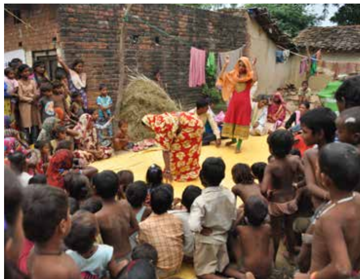
A street play, Badalti Tasveer , being staged at Bharkarra village.