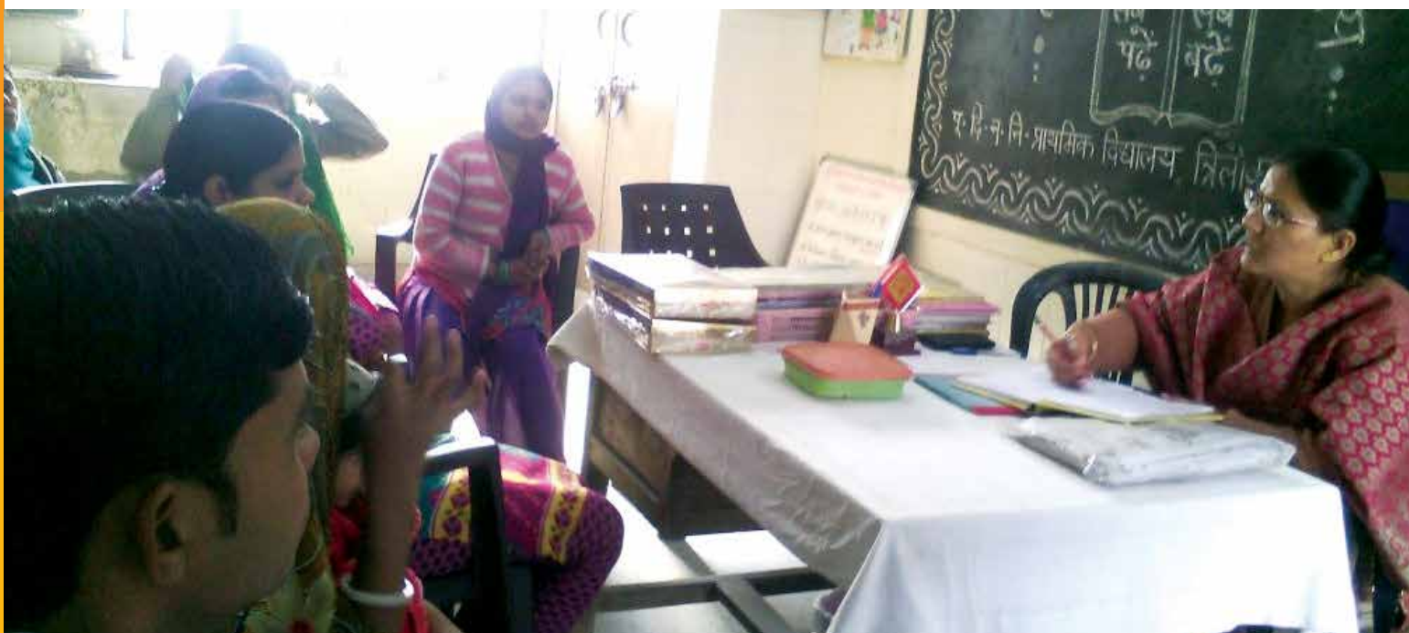
Members of School Management Committee meet the school principal, at a TrilokपुरI primary school after inspections

Oxfam India and JOSH have played a critical role in capacity building and facilitating the process of regular school inspections by the SMC. These school inspections have evolved into a collective space where parents and teachers work towards a common aim of improving access to better education for their wards.