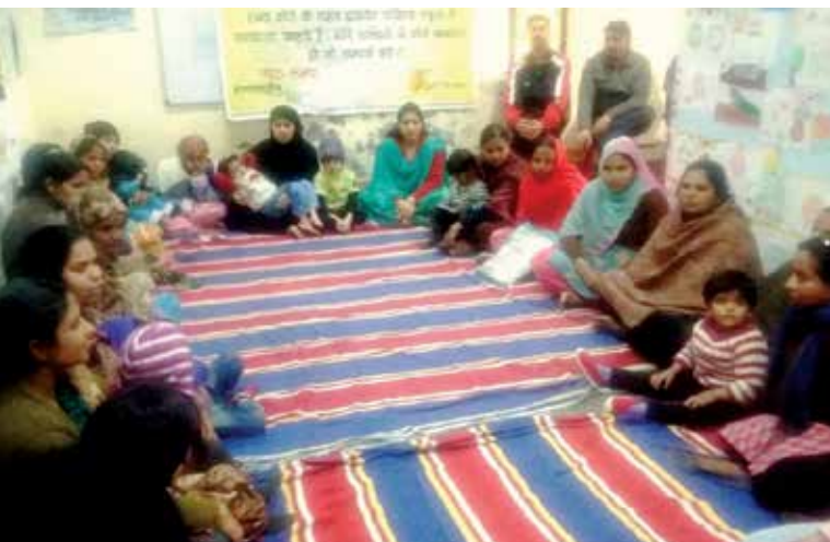
Community meetings with SMC members & parents

for schools to make temporary arrangements. For instance, prior to the school inspections, some of the schools clean up the toilets, which, on other days is usually inaccessible. Nevertheless, Oxfam India and JOSH are hopeful that the situation will improve and become sustainable in the long run. After all, the schools that were initially wary of inspections have opened to the idea of community oversight. This, in itself, is a big step forward.