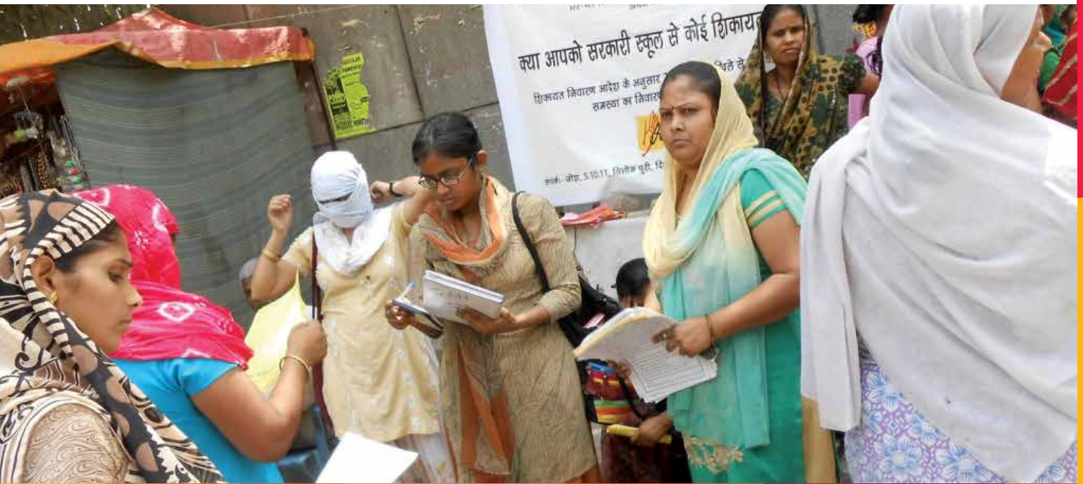
Awareness campaign on Grievance Redressal

Regular SMC meetings and school inspections have inspired parents to be more involved in their children's education and functioning of the school. They have consistently taken up day-to-day critical issues, such as locked toilets, exposed live wires, broken fans, and uncovered drains. One parent informs us how they managed to get the full scholarship amount from the school; the principal had given only Rs 700 out of a scholarship of Rs 1000.